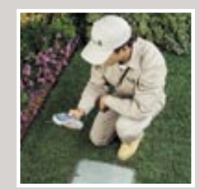
The WVP is now ready to communicate with the WVC from as far away as 100 feet.

Replace the valve box cover and the hermeticallysealed WVC is protected from water, dirt, and contaminants.